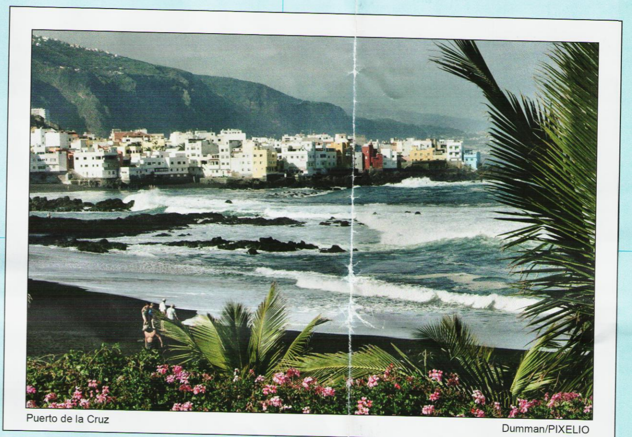
Puerto de la Cruz