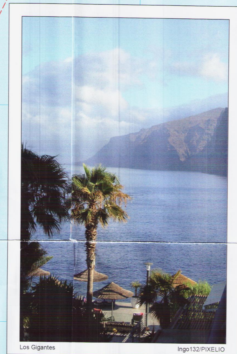
Los Gigantes Ingo132/PIXELO