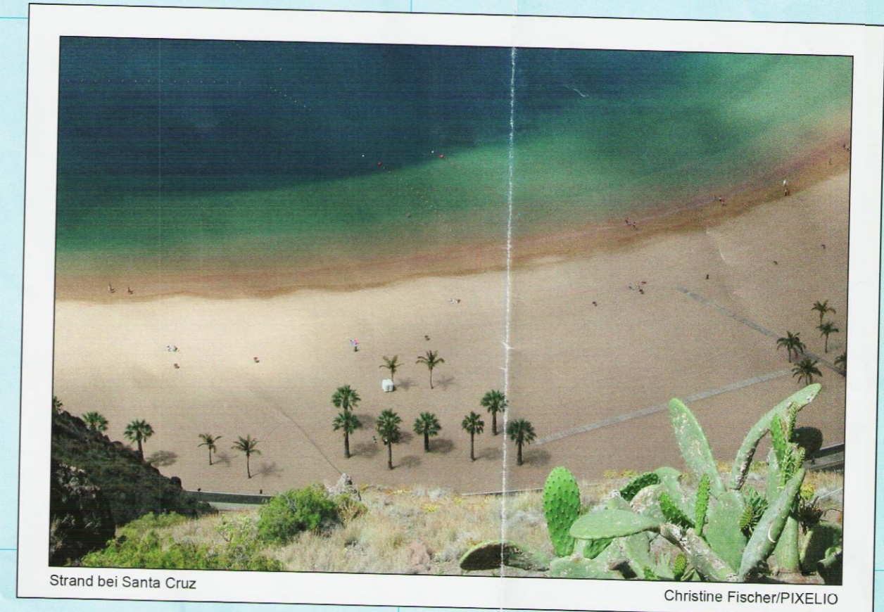
Strand bei Santa Cruz