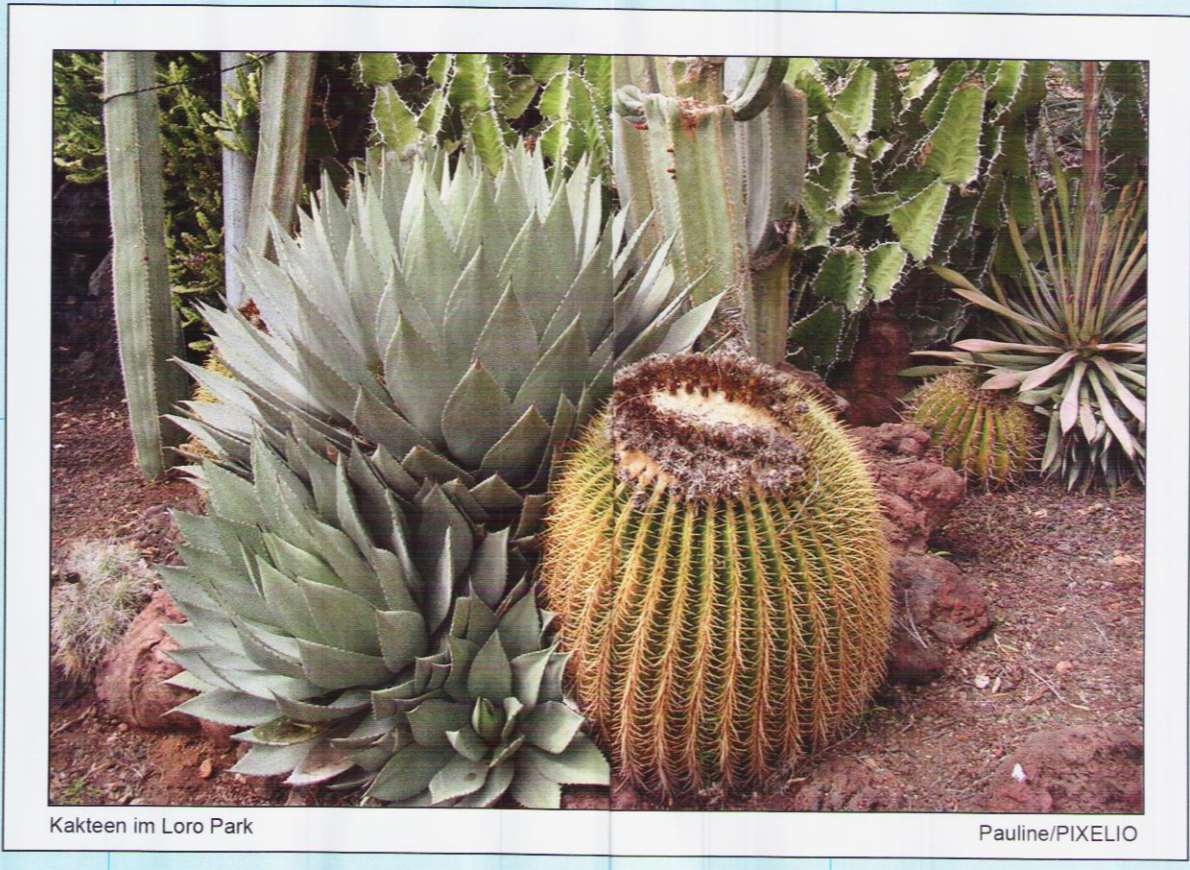
Kaktus im Loro Park Pauline/PIXELO