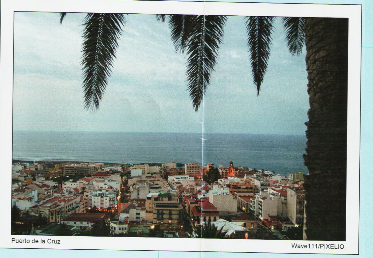
Puerto de la Cruz